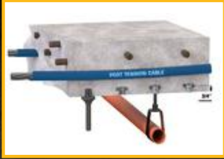
Post Tension Concrete